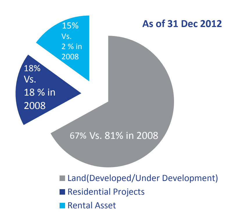
Since 2008 - Non land assets grew from 19% to 31%

Gradual earnings diversification towards land development, residential master planned communities development and rental asset